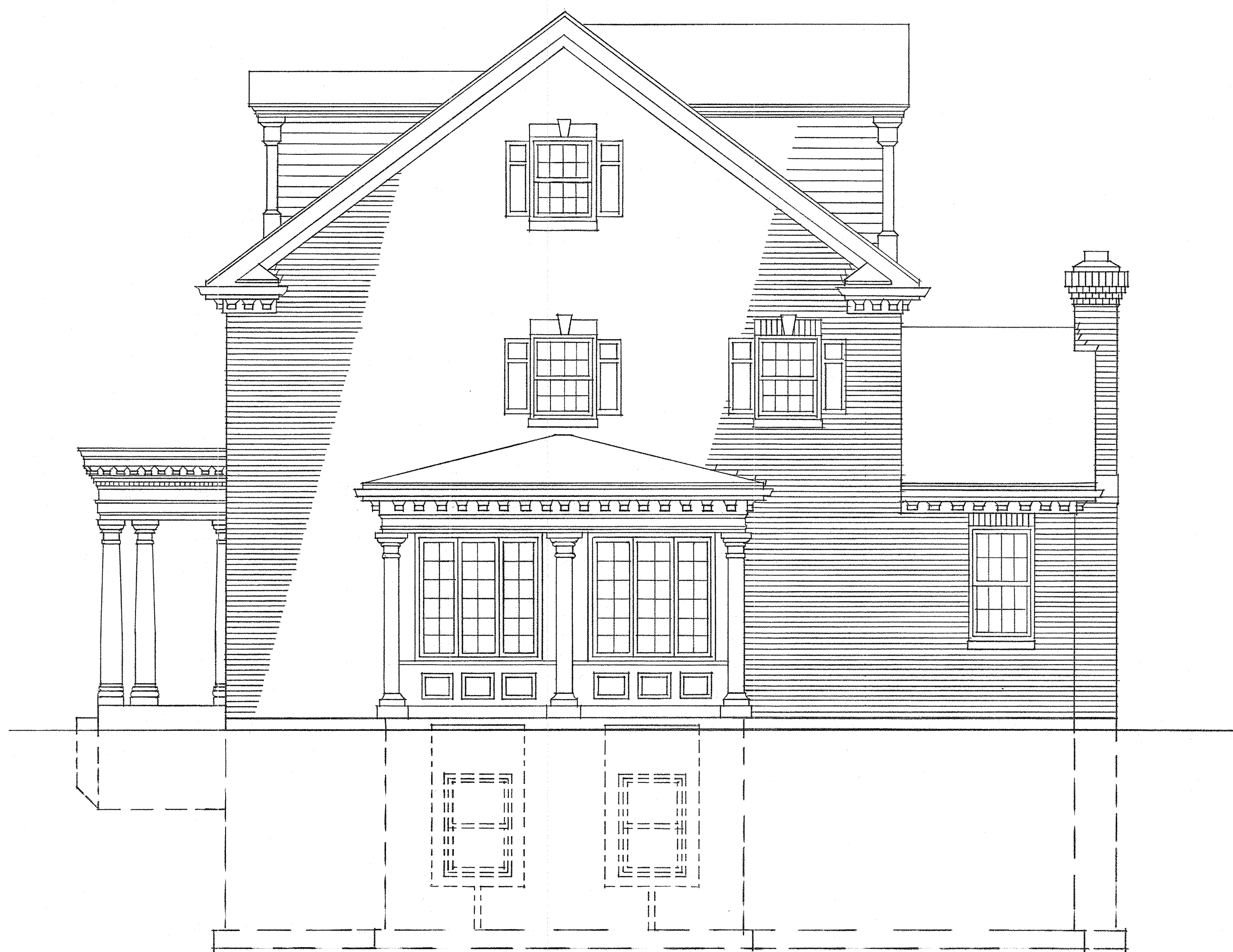
RIGHT SIDE ELEVATION \frac{1}{4}'' = 1'-0'' (WEST SIDE)