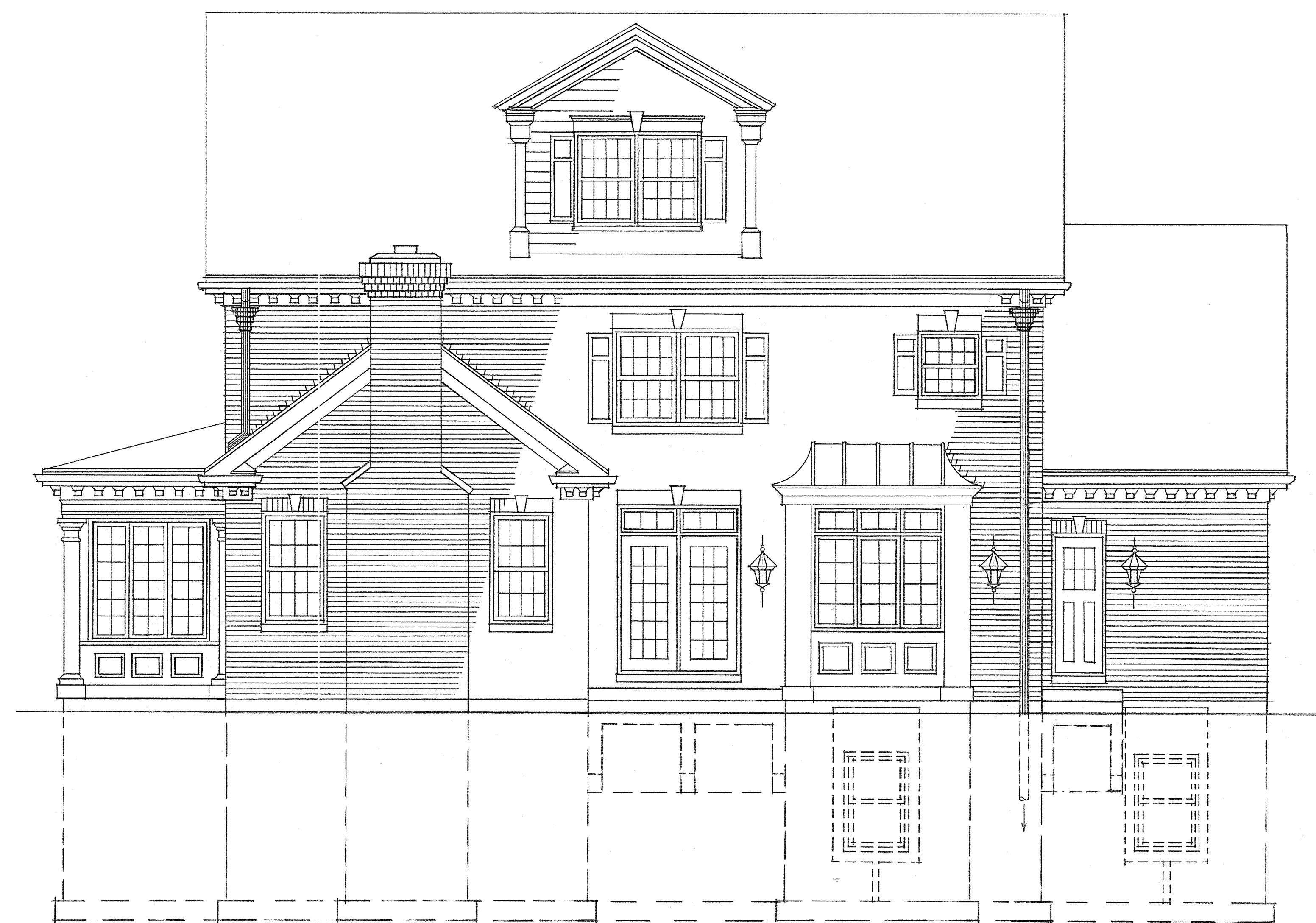
REAR ELEVATION \frac{1}{4}'' = 1'-0'' (SOUTH SIDE)