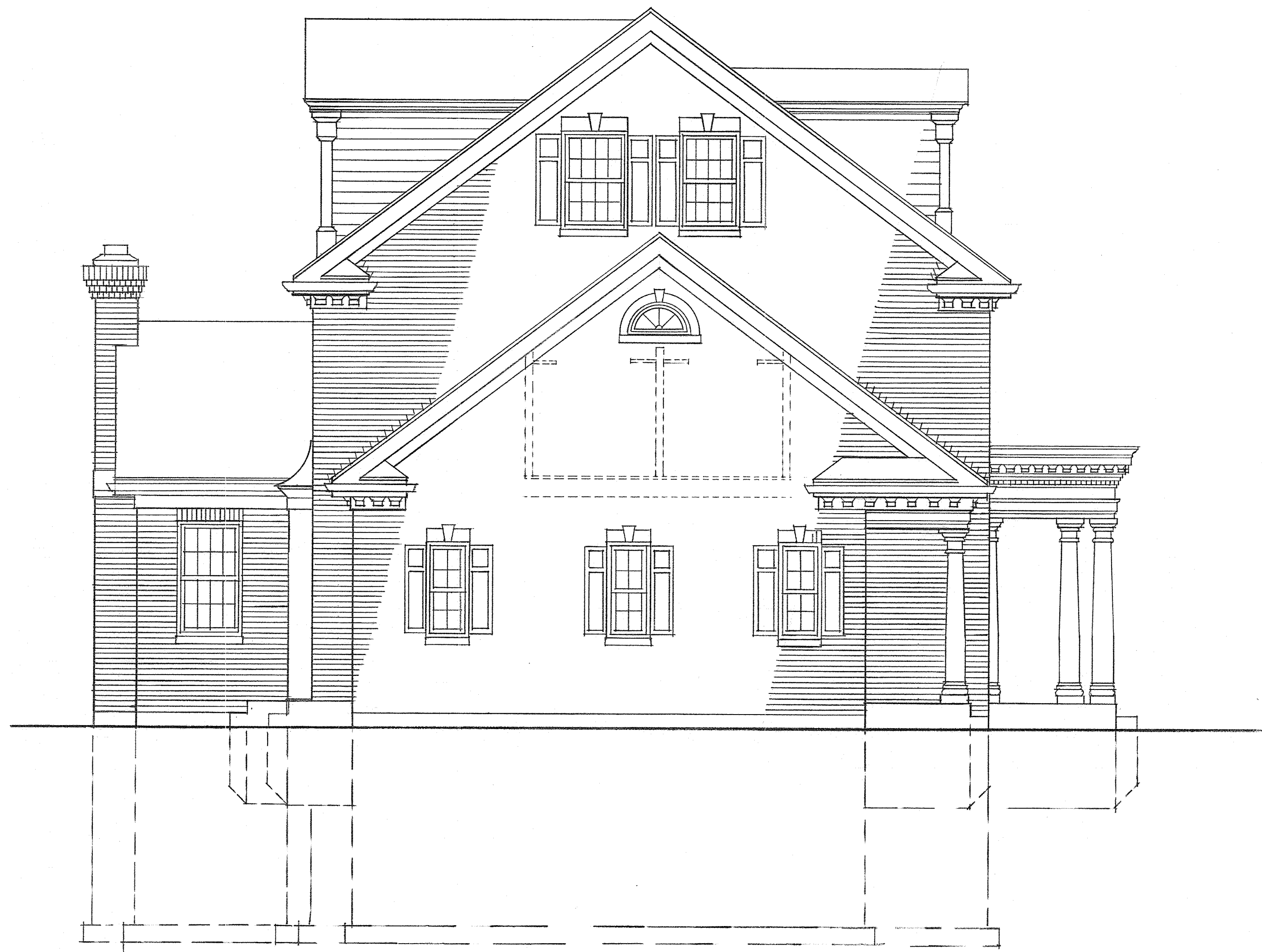
LEFT SIDE ELEVATION \frac{1}{4}'' = 1'-0'' (EAST SIDE)