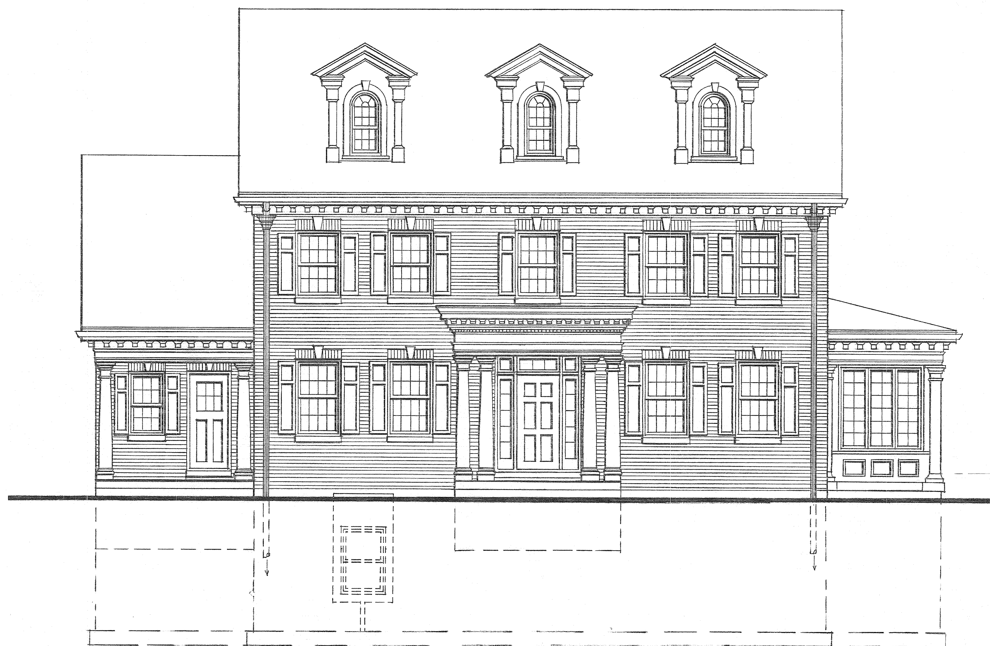
FRONT ELEVATION \frac{1}{4}'' = 1'-0'' (NORTH SIDE)